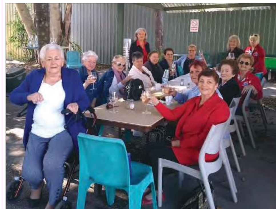
■ PICTURED are members of the Bribie Island RSL Women's Auxiliary who enjoyed a chicken and salad day on Monday, September 9 after their meeting.