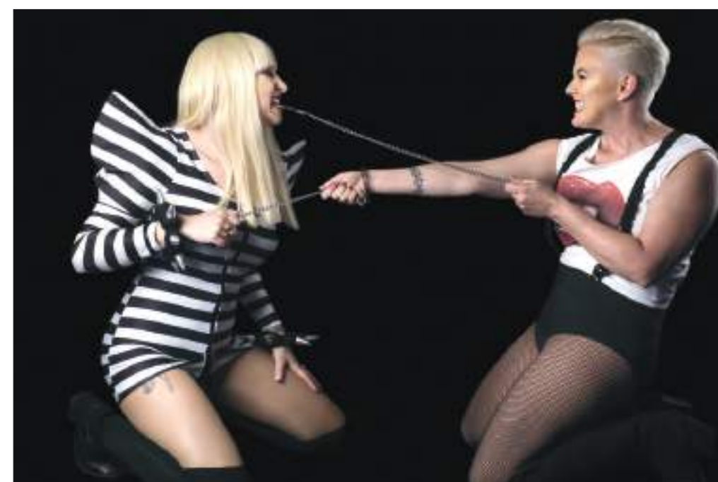
PINK/LADY GAGA TRIBUTE