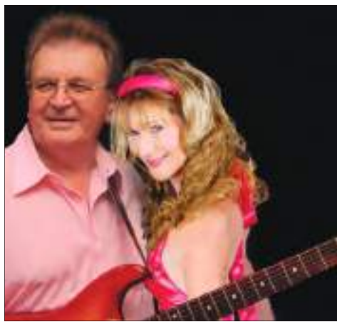
■ SWIZZLE Duo.

The television and radio personality has