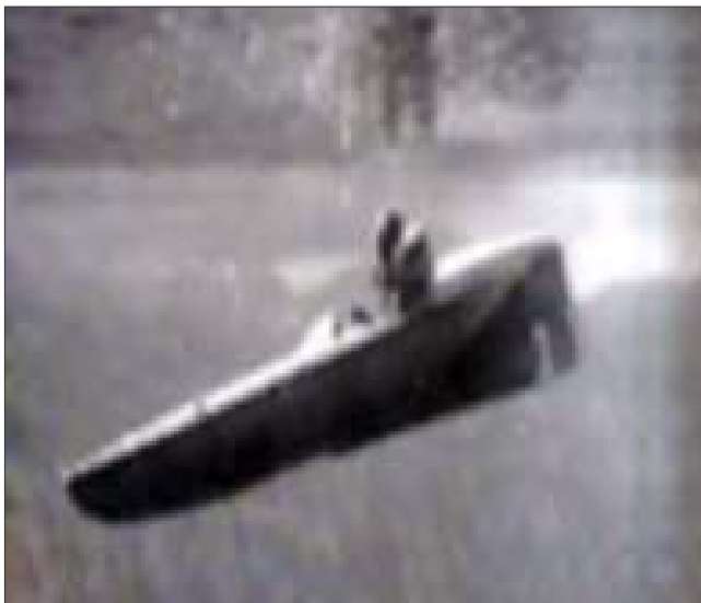
■ AN example of the semi-submersible canoes and the route that Operation Rimau took.