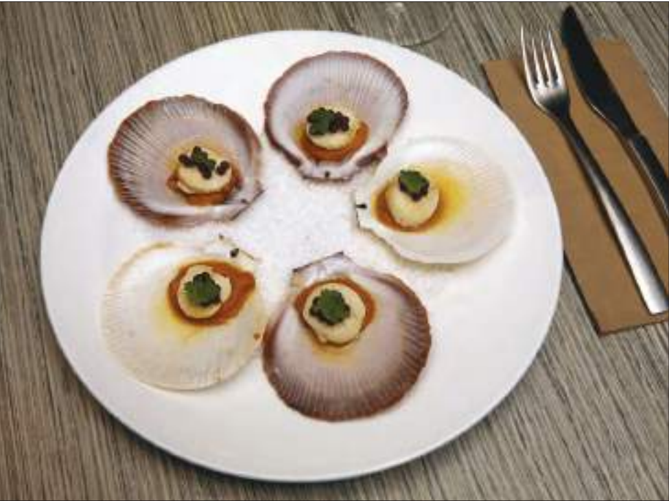
■ STEAMED Hervey Bay scallops with spiced carrot puree and soy pearls.