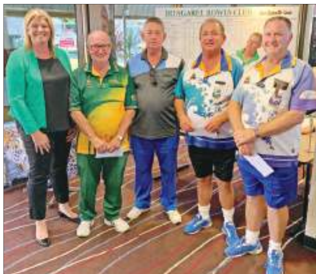
■ MEN'S carnival winners Bribie Island with five wins and 40 shots.