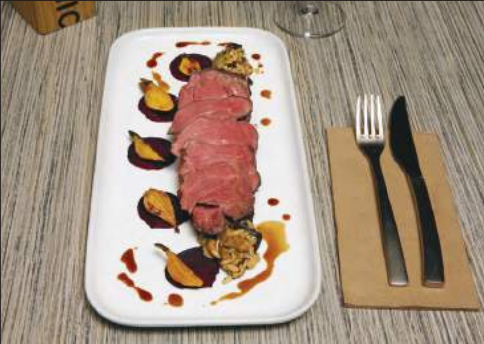
■ SLOW cooked beef rump with wild mushroom and truffle risotto and smoked beetroot ribbons.