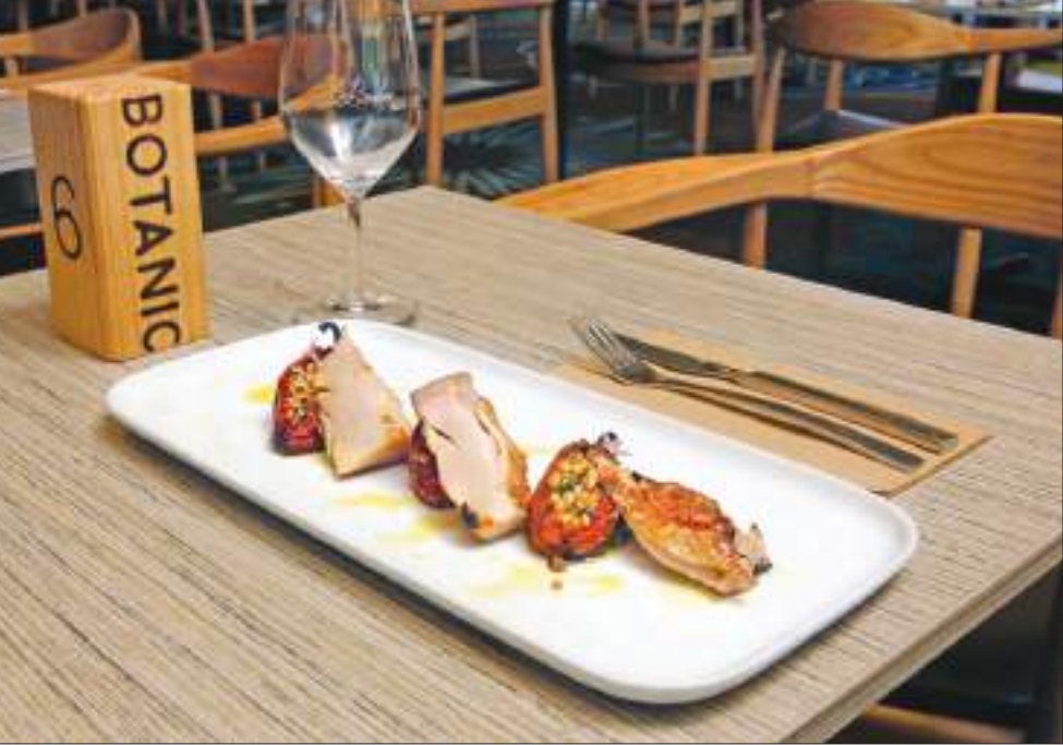
■ SMOKED chicken breast with pearl couscous stuffed baby bell peppers and bunya nut pesto.