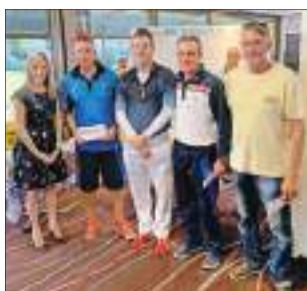
■ SECOND-PLACED Kawana with four wins and 56 shots.

It was fantastic to see many members contributing from raffle ticket sellers, barbecue cooks, umpires, scorers, members behind the scenes and many of our ladies members giving great support.