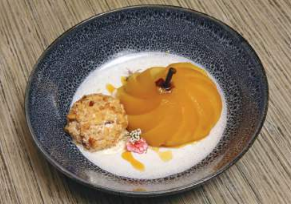
■ VANILLA and saffron poached pears with roasted macadamia nut ice cream and saffron glaze.