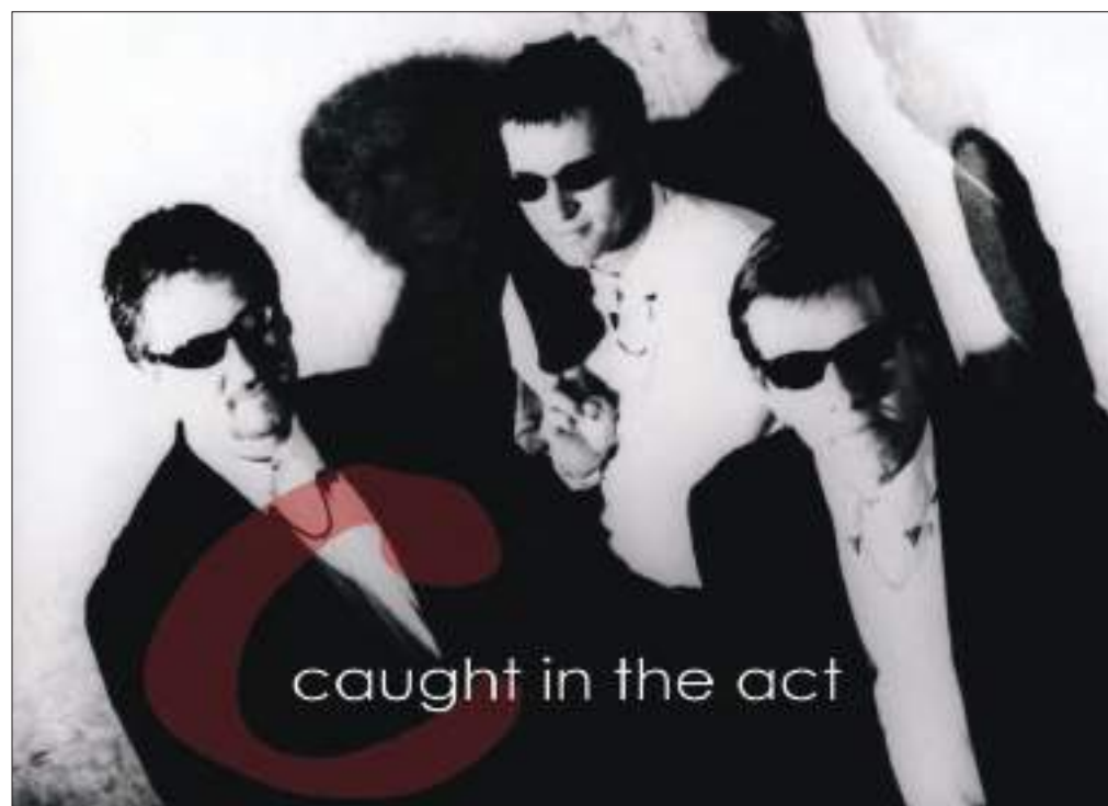
caught in the act