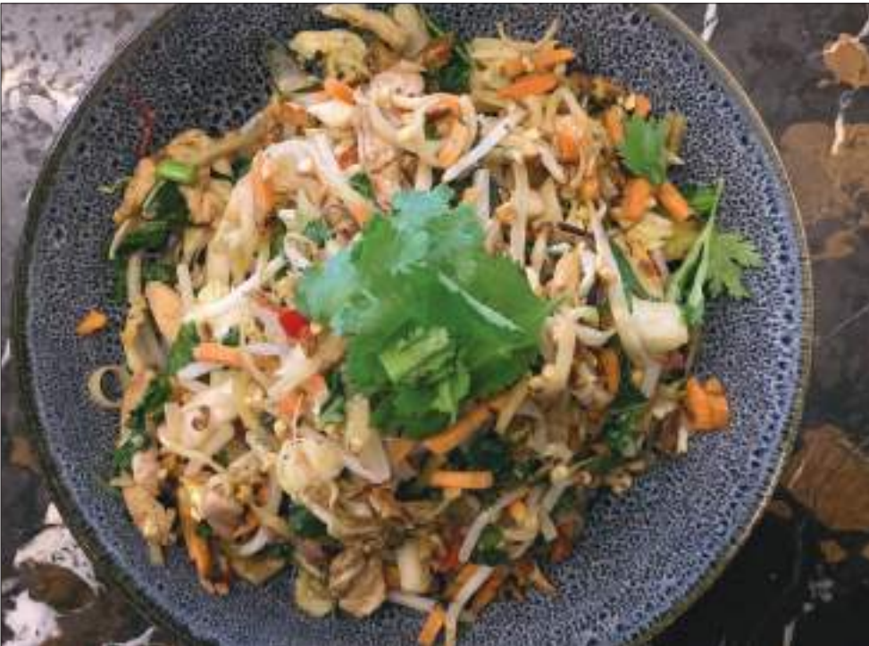
■ WOK-TOSSED seasonal vegetables with Asian greens, flat rice noodles, crushed peanuts and Thai-style sauce.