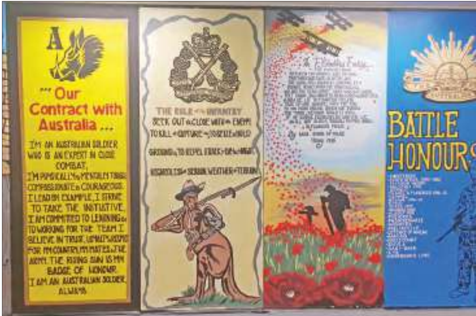
■ THE soldier's contract with Australia, role of the infantry, battle honours and the unit symbol of a razorback boar.