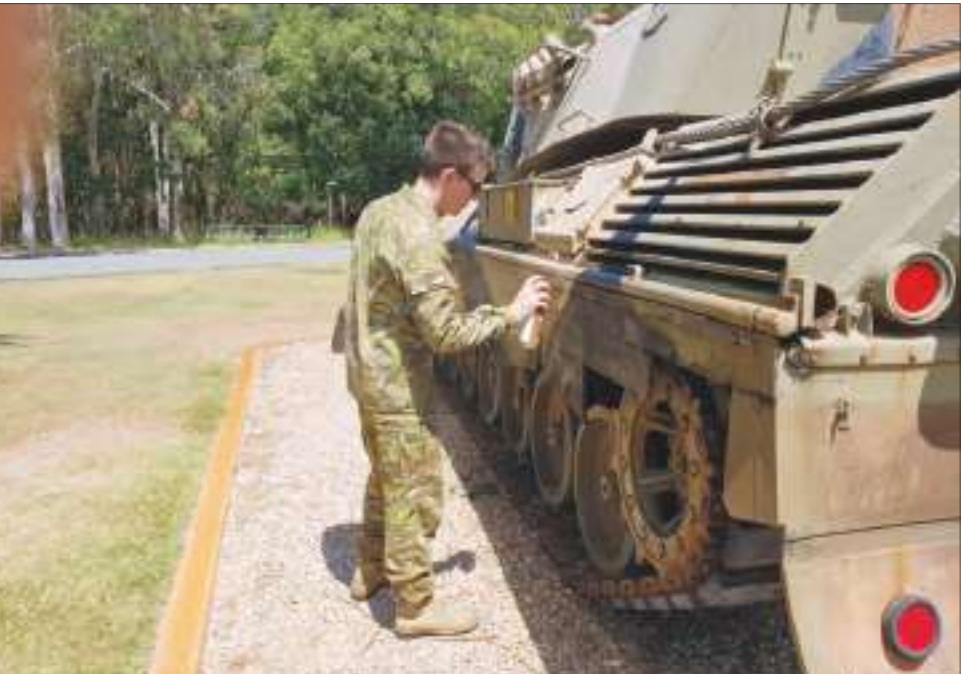
■ MAINTENANCE is carried out on a Leopard tank by a member of 12/16 Hunter River Lancers.