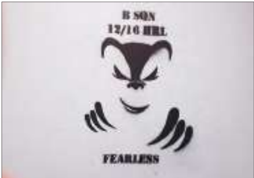
■ THE symbol of a honey badger of B Squadron located in Caboolture.