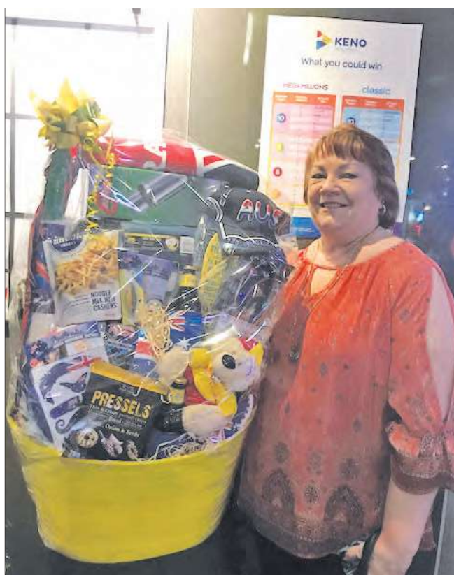
■ ANOTHER lucky winner in the Australia Day draws.