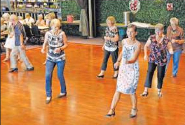
■ THE call is out for more line dancers on Thursdays.