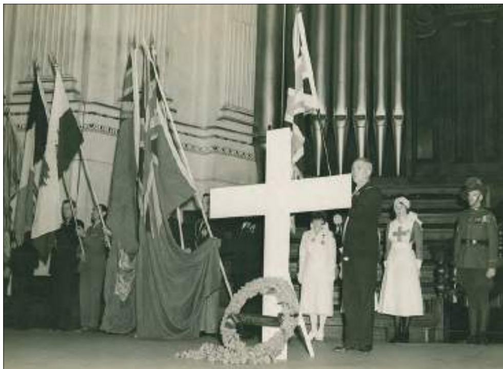
■ ARMISTICE Day was commemorated annually in Queensland. Above, returned servicemen, nurses and officials participate in an Armistice Day service at Brisbane's City Hall in the 1940s.