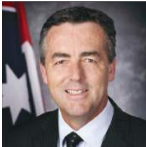
■ MINISTER Darren Chester

to the Commonwealth Superannuation Commission being a law unto itself and falsely reporting to the government in regards to DFRDB, the ATO and Family Law Court.