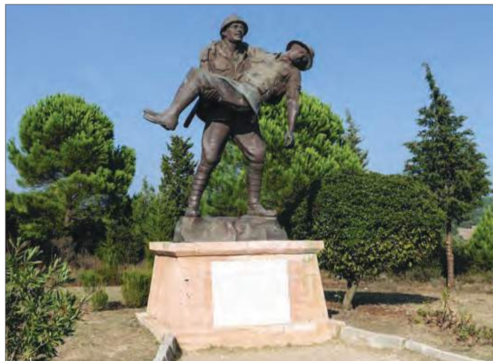
■ A TURKISH soldier carries a wounded Australian soldier back to the Australian lines at Gallipoli for medical attention. As history has shown, this private soldier later was to become the first Australian-born Governor General Lord Casey.

The wreck of the former hospital ship Maheno and remnants of the Z Special Unit training camp on Fraser Island, a rare memorial bridge at Brooweena and a dramatic life-size statue of an Australian light horseman in Hervey Bay are among more than 20 stops.