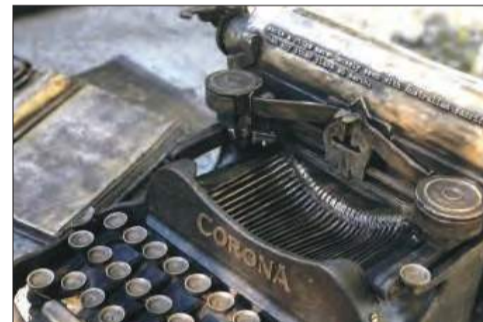
■ THE typewriter of Australian World War I correspondent Charles Bean.

A century later people were asking questions but it was apparent many misunderstandings